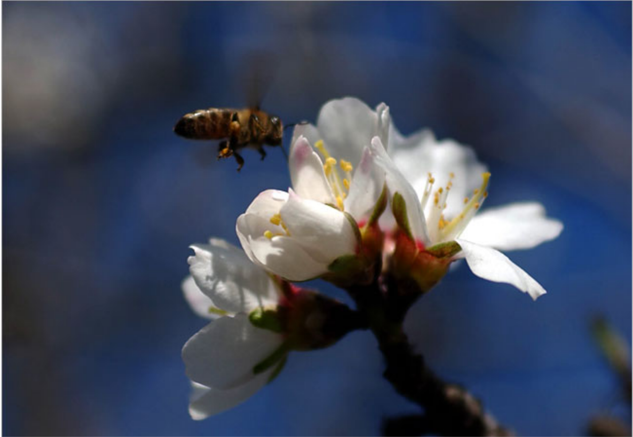
A honeybee collects nectar from an almond tree in bloom.

where bees can forage for nectar to stay healthy and strong during the pollination season.